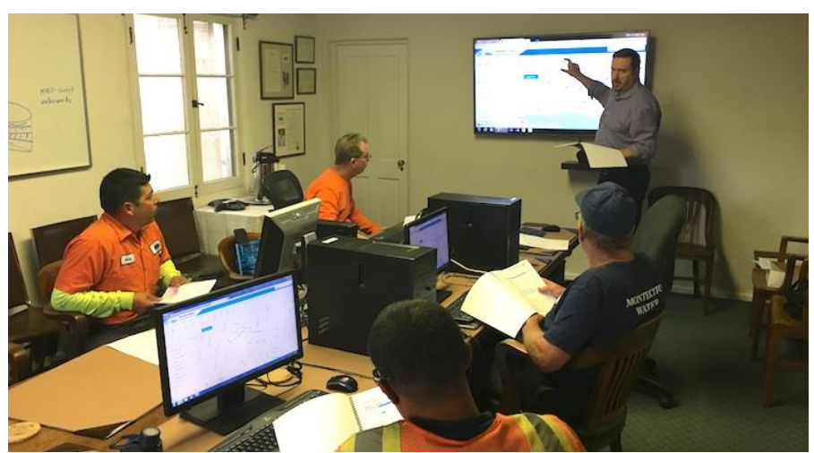
ZWORLD GIS - Providing Staff Training

In the Level 2 Advanced training session, staff is introduced to more in-depth use of the GIS data. This training session provides application techniques that are specific to a certain District operation. For example, the District staff would use this session to develop understanding of the Water GIS data. This session covers advanced Searching, Markup Tools, advanced Map documents, and using the application for projects.