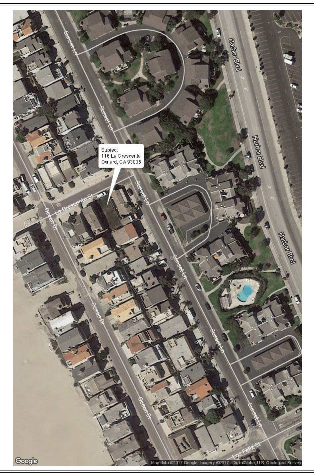
The Appraisal Place / Oppality Appraisal Services